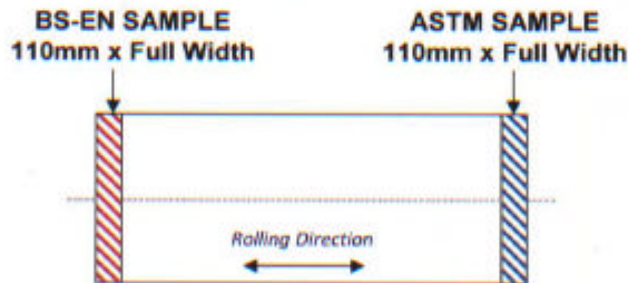
Figure 2, Light Plates, Full Width sample

For plates between 5mm and 8mm (Light Plates) 110mm x full width sized samples, as can be seen in Figure 2, are required.